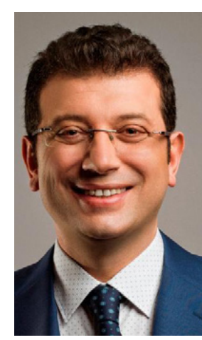
THREATENED Ekrem İmamoğlu Mayor of İstanbul (CHP)

Member of Parliament, HDP Co-Leader & Presidential candidate