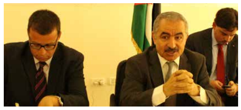
Minister Mohammad Shtayyeh from the Palestinian Liberation Council

It is the impunity surrounding the occupation that is the root cause of the Gaza conflict.