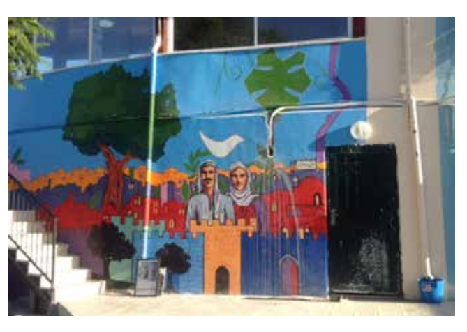
"From our meetings with peace organisations what we heard was a clear call for the international community to realise that the negotiations are over. Israel enters into the negotiations but then carries out deadly military attacks and land grabs - a direct contradiction with the peace it claims to want to work towards. Rather than continuing their support for talks, world leaders should be loudly denouncing the Israeli occupation of Palestine for what it is, the deliberate and systematic extermination of Palestinians from their land, nothing short of social genocide."