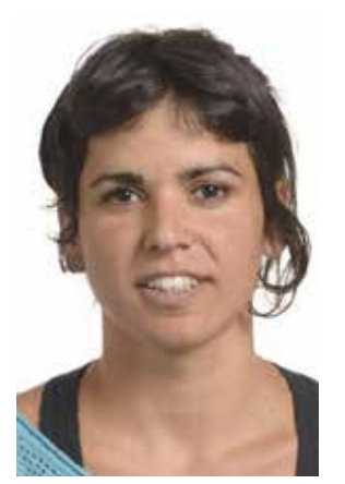
Teresa RODRÍGUEZ-RUBIO PODEMOS Spain